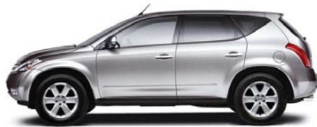
S: REDEFINITION OF ADVENTURE