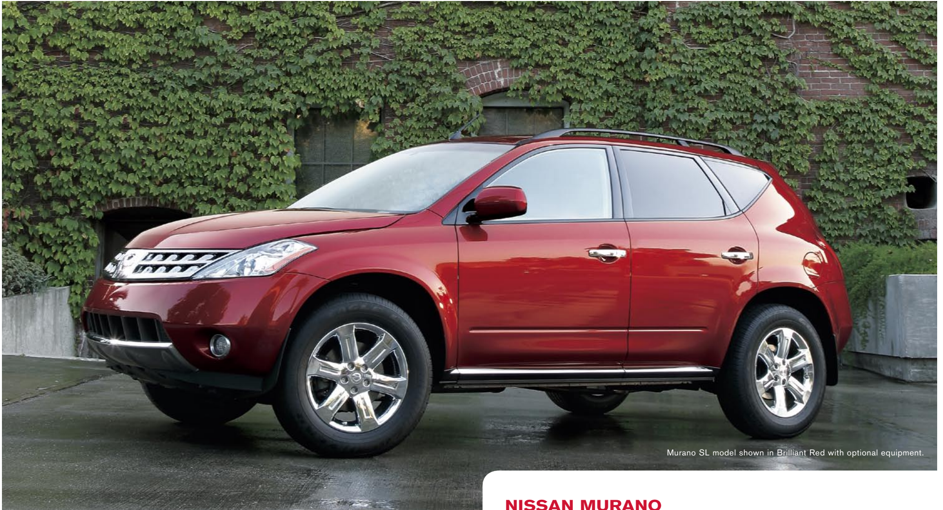
Murano SL model shown in Brilliant Red with optional equipment.