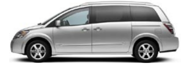
3.5 SE: RALLIES AROUND YOU