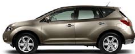
S: REDEFINITION OF ADVENTURE