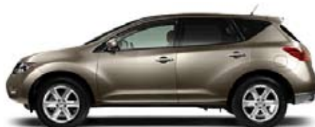
SL: STATEMENT OF BEAUTY