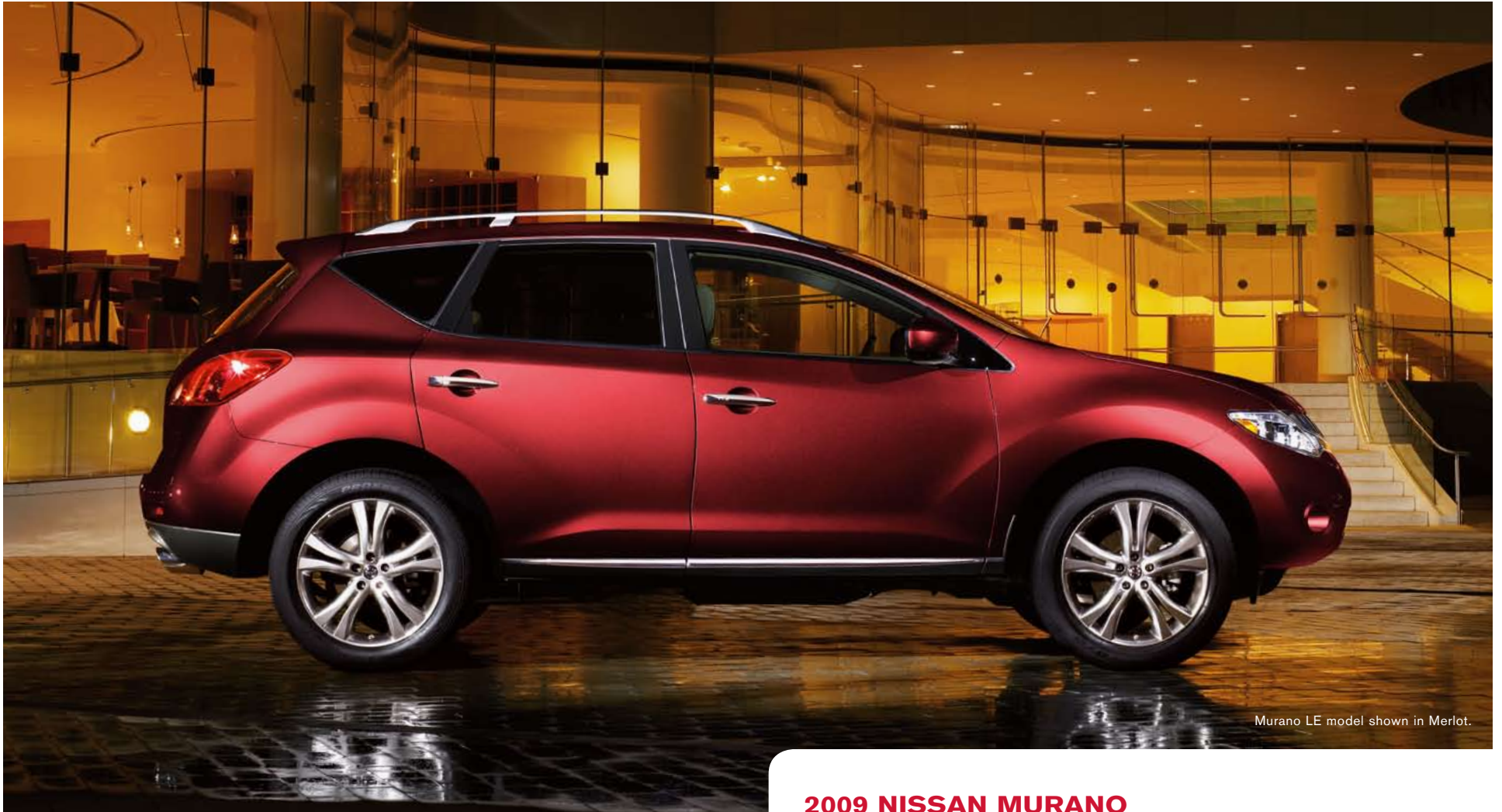
Murano LE model shown in Merlot.