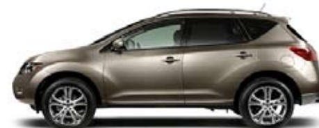
LE: PORTRAIT OF LUXURY