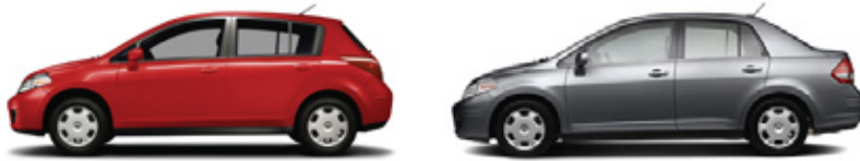
1.8 S: MORE THAN YOU BARGAINED FOR.