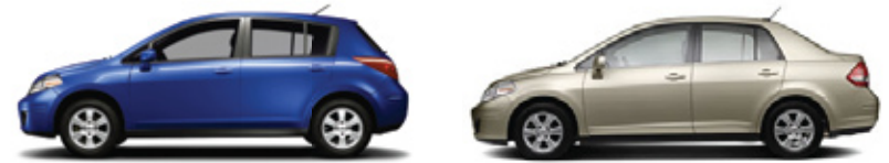
1.8 SL: BIG CONVENIENCE. SAME SMALL PACKAGE.