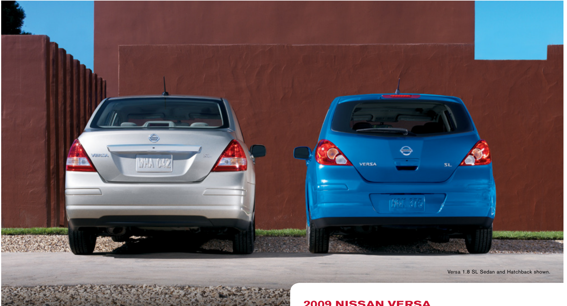
Versa 1.8 SL Sedan and Hatchback shown.