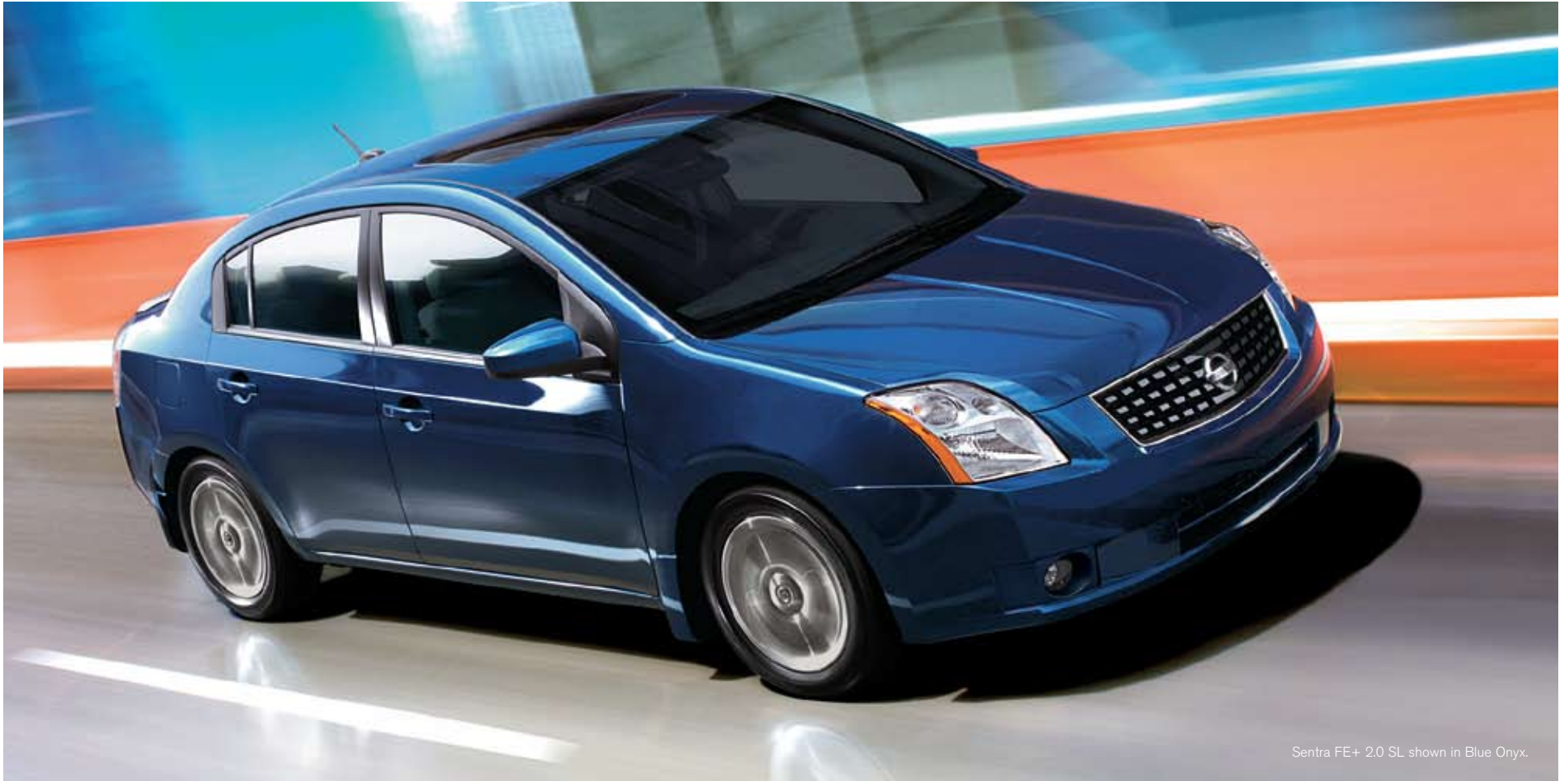
Sentra FE+ 2.0 SL shown in Blue Onyx.