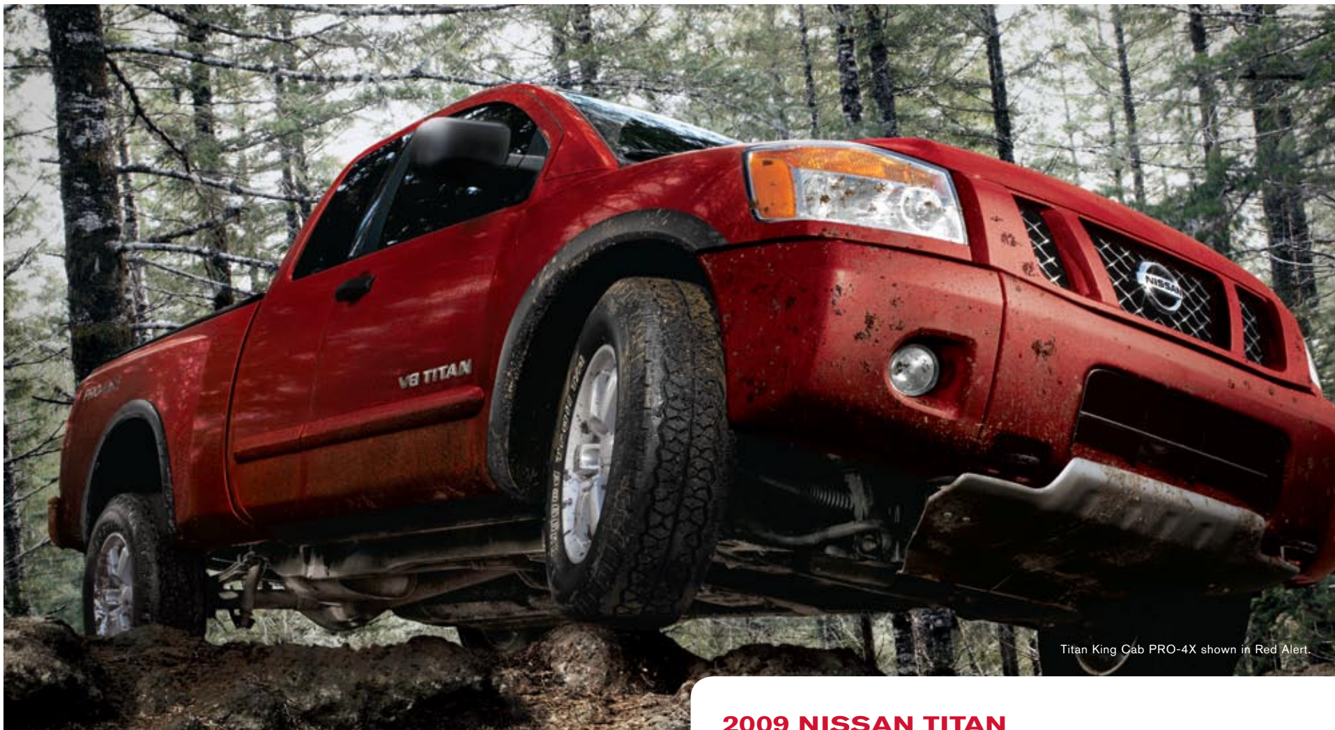
Titan King Cab PRO-4X shown in Red Alert.