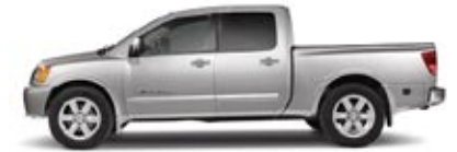
LE 4X2 AND 4X4