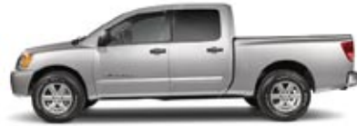
SE 4X2 AND 4X4