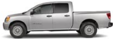
XE 4X2 AND 4X4