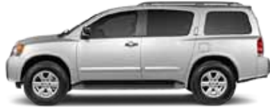
SE: LET THE ADVENTURE BEGIN