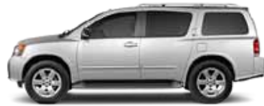
TITANIUM: BRING ON THE WORLD