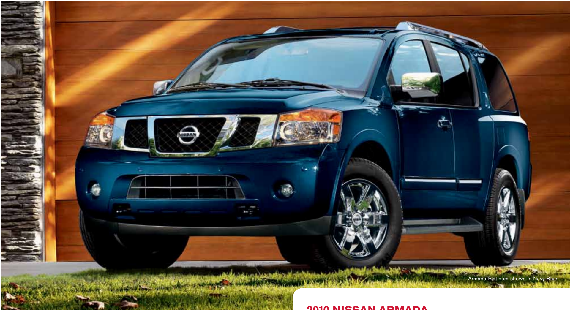
Armada Platinum shown in Navy Blue.