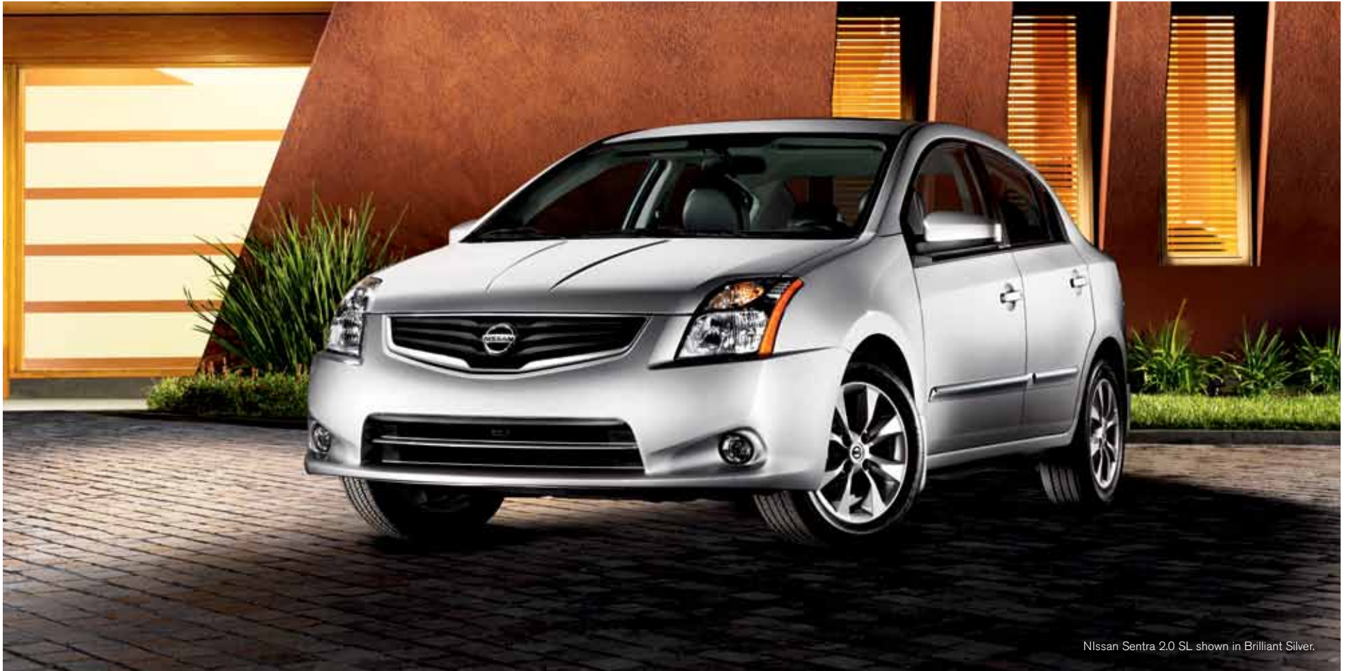
Nissan Sentra 2.0 SL shown in Brilliant Silver.