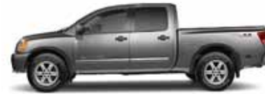
PRO-4X KING CAB AND CREW CAB