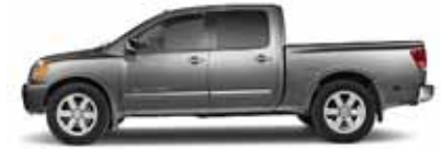
LE CREW CAB