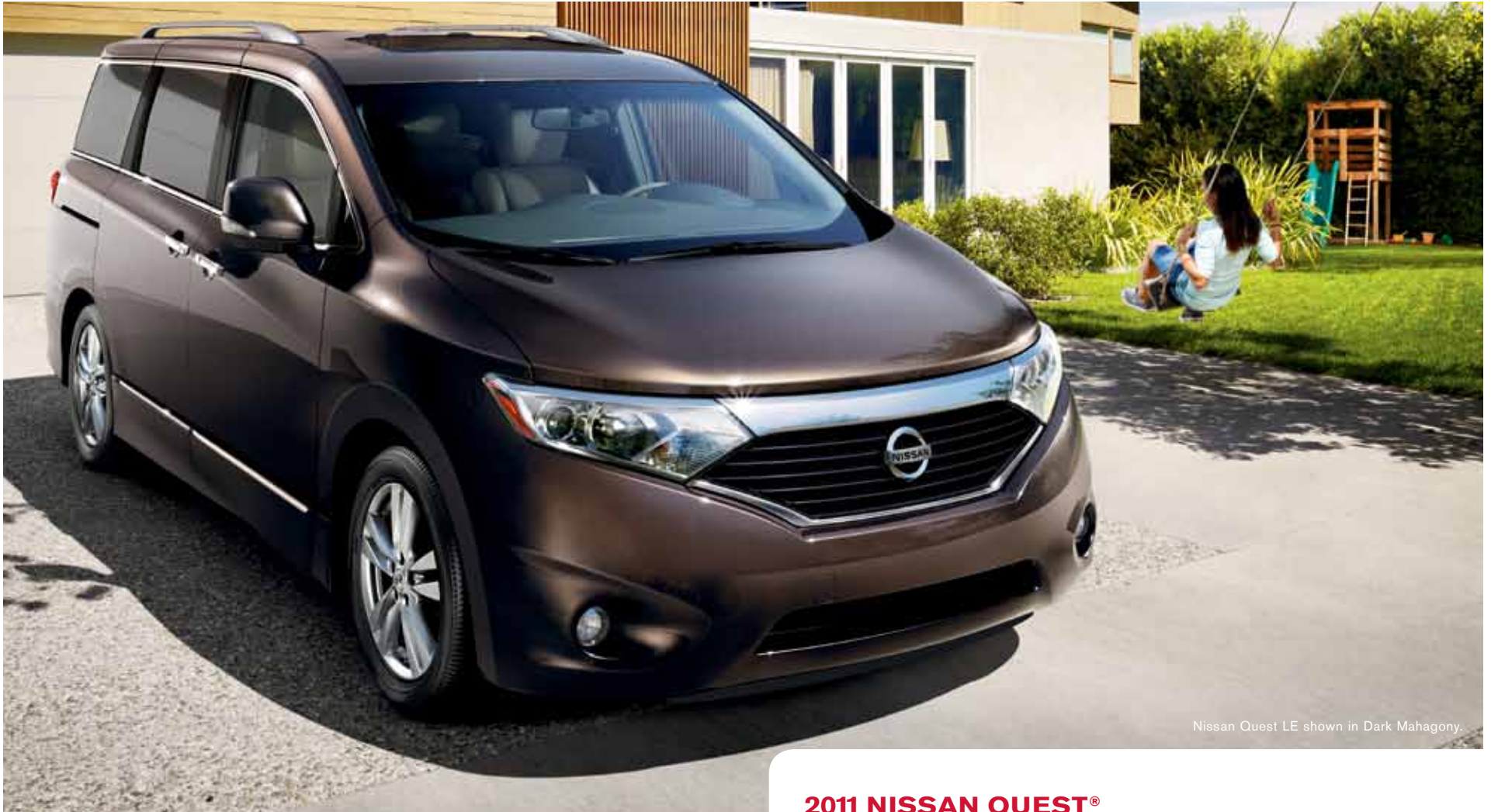
Nissan Quest LE shown in Dark Mahogany.