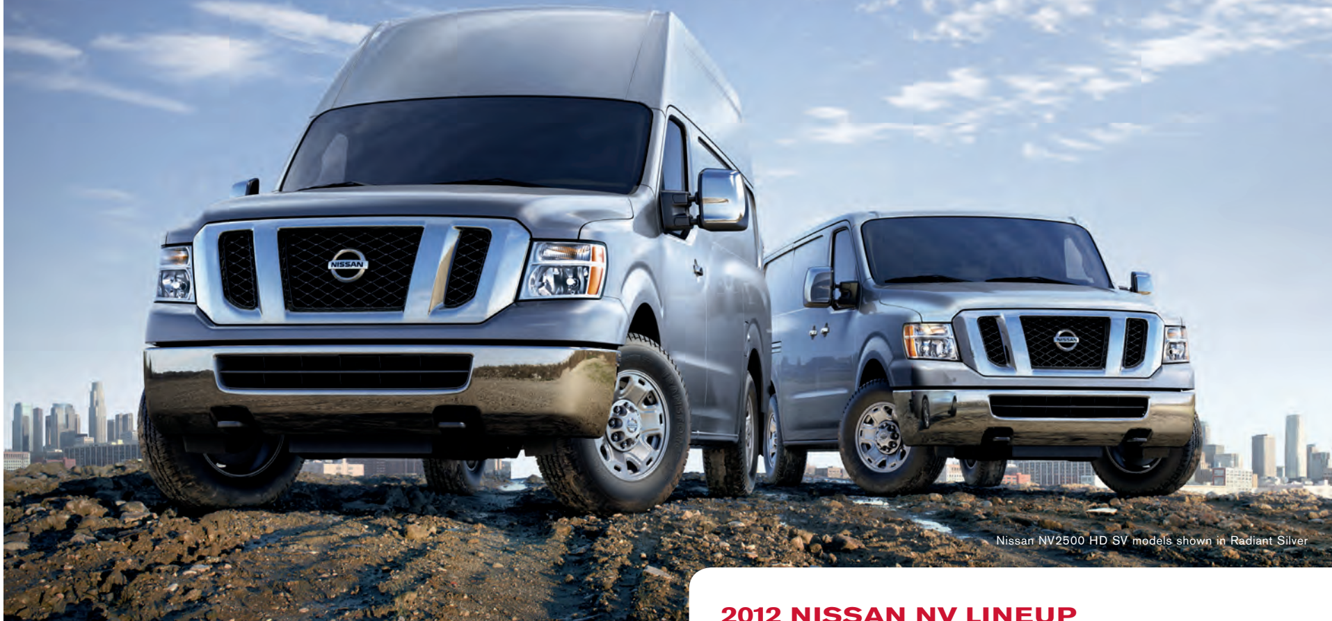
Nissan NV2500 HD SV models shown in Radiant Silver