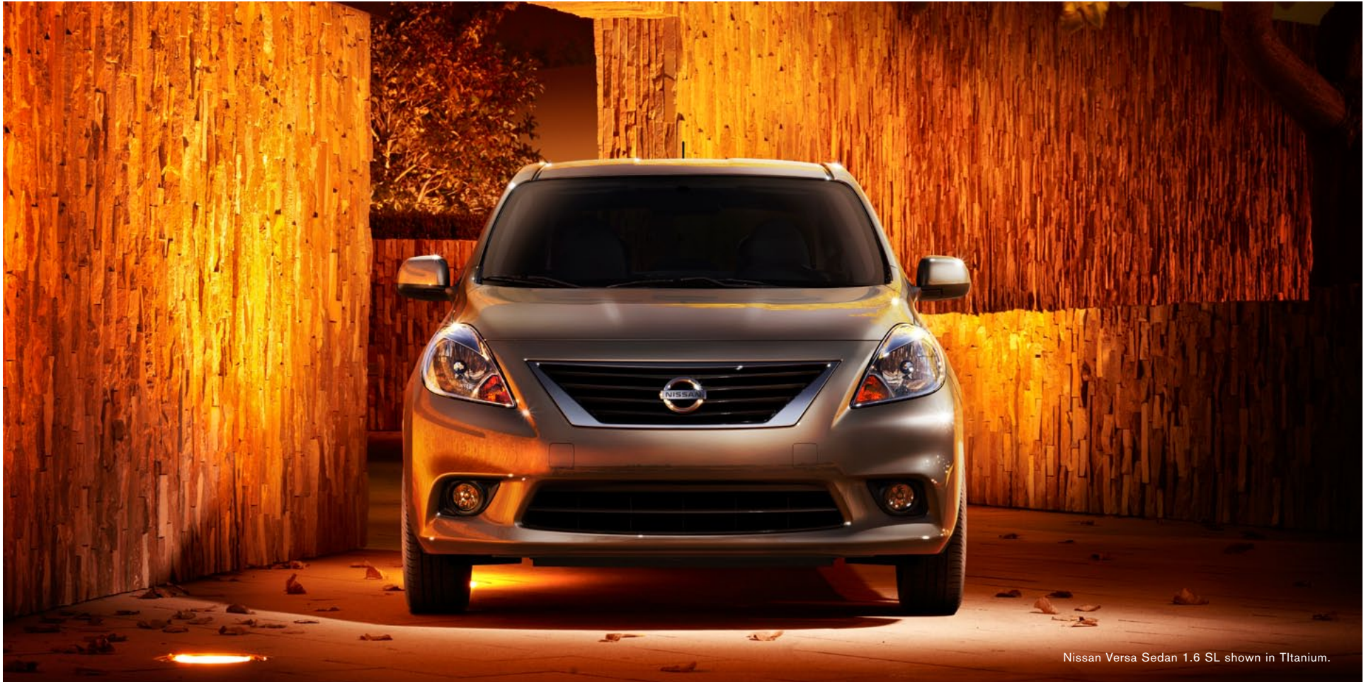
Nissan Versa Sedan 1.6 SL shown in Titanium.