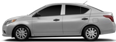
1.6 S: "STARTING AT" WAS NEVER BETTER EQUIPPED