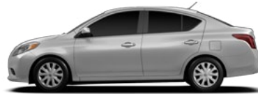
1.6 SV: A WHOLE NEW LEVEL OF COMFORT AND CONVENIENCE